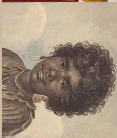
The Patji-Dawes award is named in honour of Patyegareng and William Dawes. Find out more at www.dynamicsoflanguage.edu.au